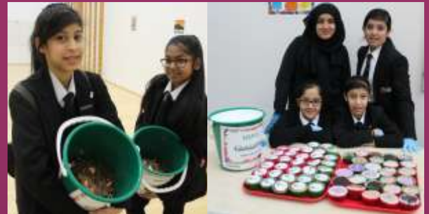
First successful event for our new Student Leaders - NSPCC Charity Number Day raised £259.