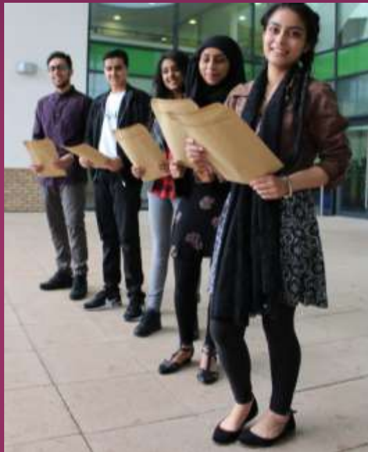
Last Year's GCSE Exam Result Celebrations.