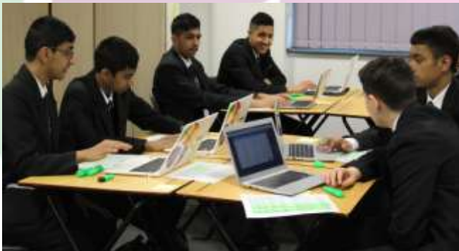
Year 11 learning valuable revision techniques.

In February, our Year 11 students had a taste of realism, with a Mock Exam Results event. Students were given the results from the January Mock Exams to provide them with an indication of the results they could expect in the real GCSE exams, which start in May.