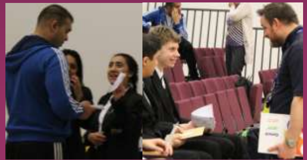
Staff and students celebrate at our Year 11 Mock Results Event.